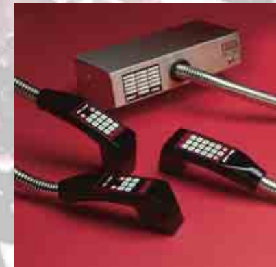
Laser™ model dispensers