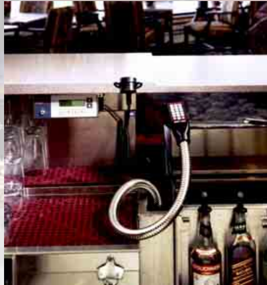
All-Bottle ID™ installation