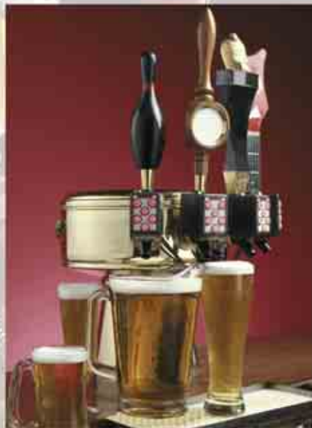
Tap1™ Draft beer bar area installation