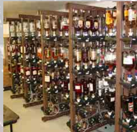
Laser™ Space Saver mounting racks