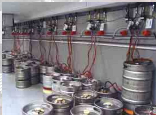
Tap1™ Draft beer supply room installation