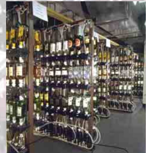
Laser™ Space Saver mounting racks