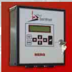
Sentinel Draft beer control console

This product meets and is certified to NSF standards.